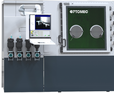
CS250 Shown with Controlled Atmosphere Option