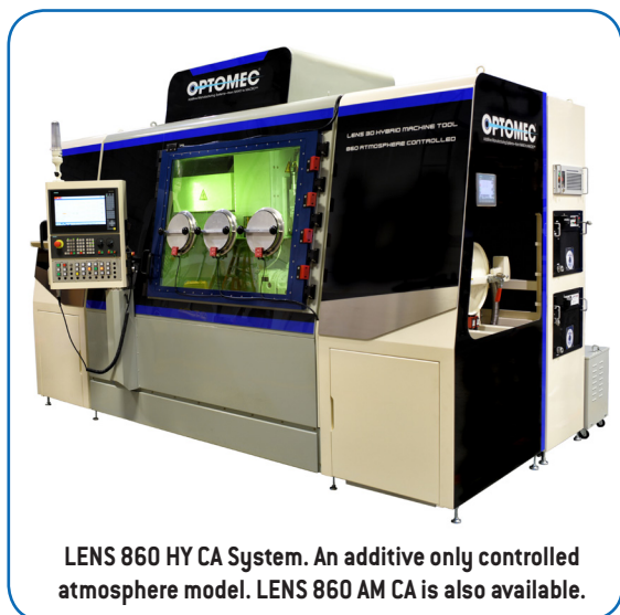
LENS 860 HY CA System. An additive only controlled atmosphere model. LENS 860 AM CA is also available.

Larger Work Envelope & Higher Power Bring More Capabilities for Affordable, High Quality Metal Hybrid Manufacturing.